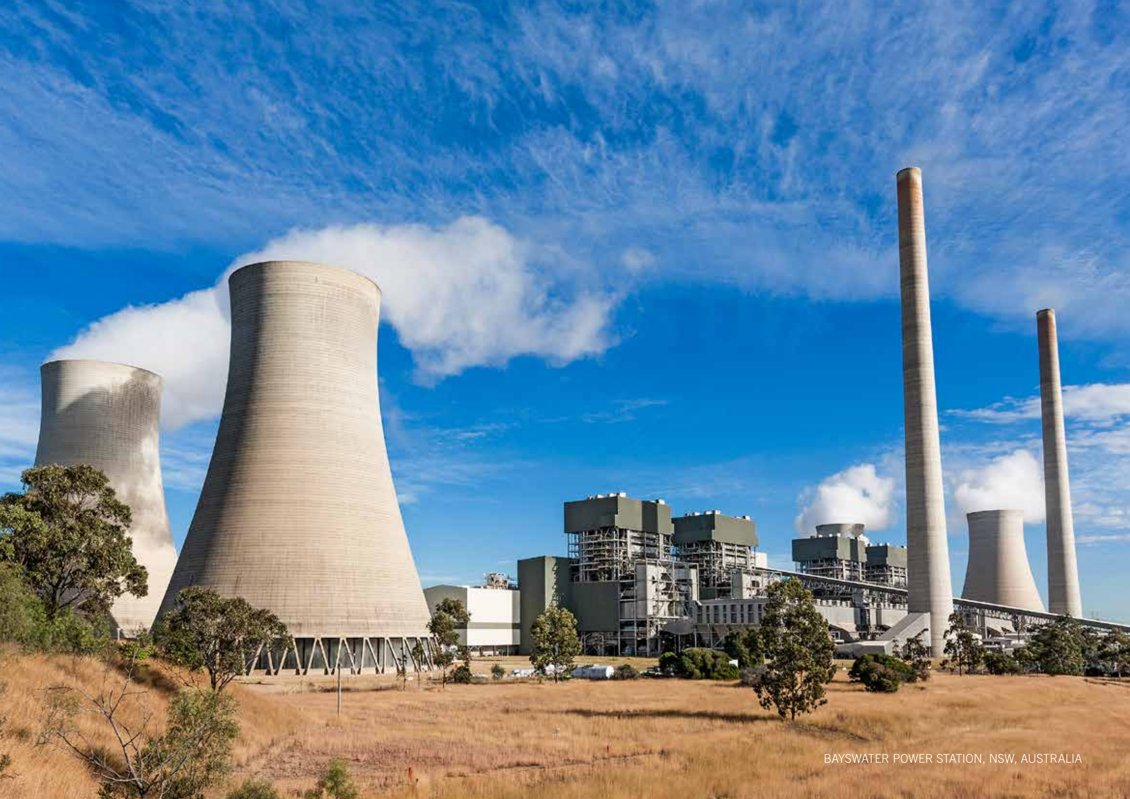
BAYSWATER POWER STATION, NSW, AUSTRALIA